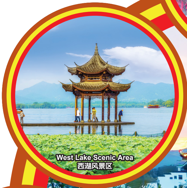
West Lake Scenic Area 西湖风景区