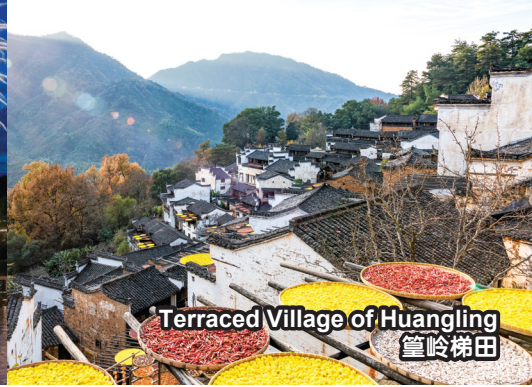
Terraced Village of Huangling 篁岭梯田