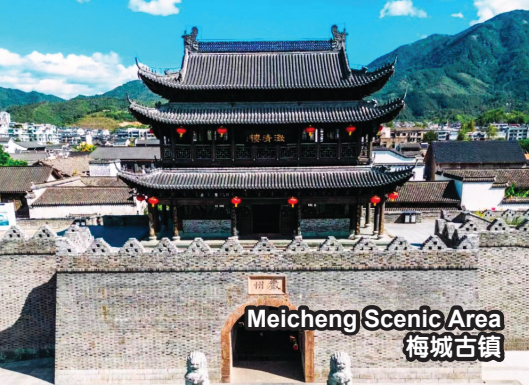
Meicheng Scenic Area 梅城古镇