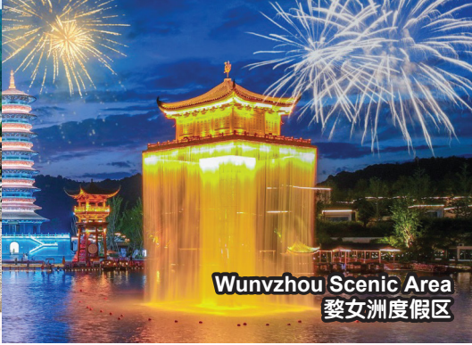
Wunvzhou Scenic Area 婺女洲度假区