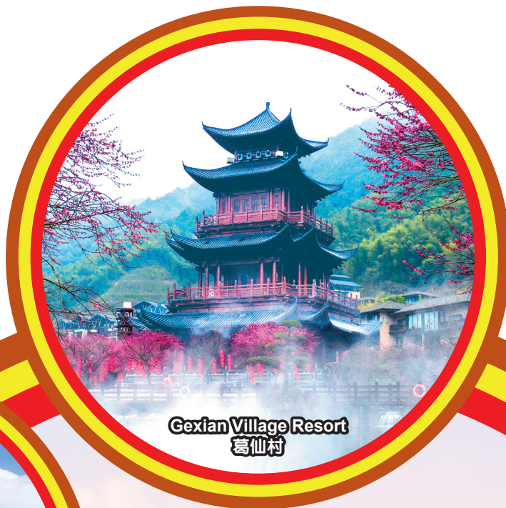
Gexian Village Resort 葛仙村