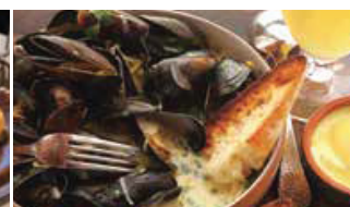
3 Course Meal –Mussels Meals