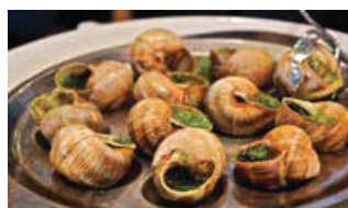
3 Course Meal –French Cuisine with Escargot