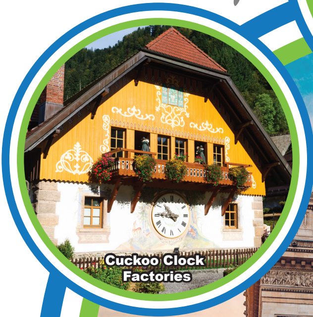
Cuckoo Clock Factories