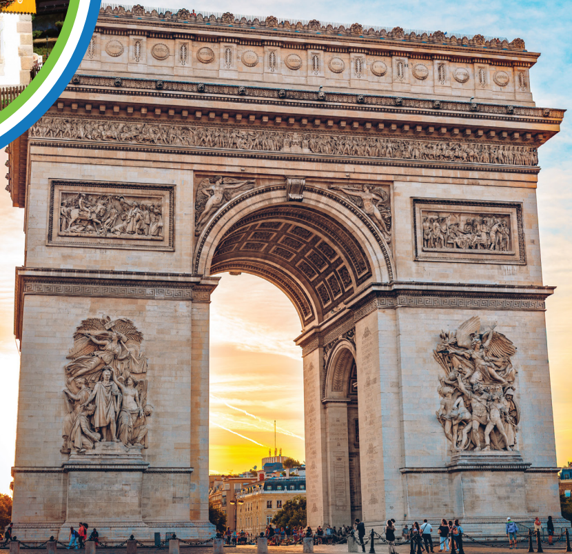
Arch of Triumph