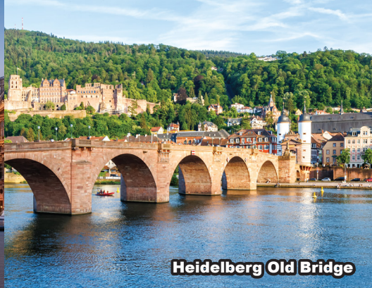
Heidelberg Old Bridge