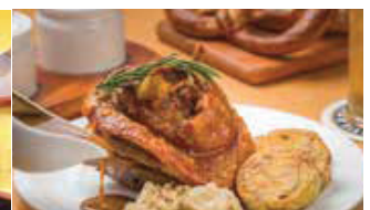
3 Course Meal –German Lunch with Pork Knuckle

Disclaimer: During major conferences, fairs and festivals, act of nature and heavy flow of tourist arrival, the sequence of itinerary may change and accommodation may be located in an alternative city without prior notice.