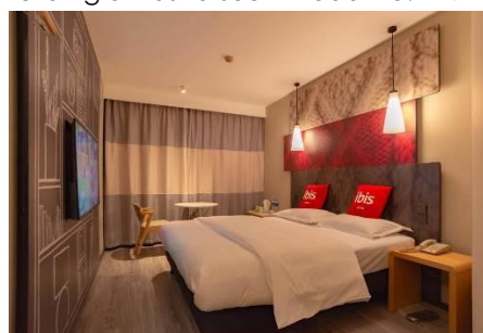
宜必思大酒店或同级 Ibis Wuxi HI Tech Hotel or similar 新区新光路 303 号 303 Xingguang Rd, Binhu