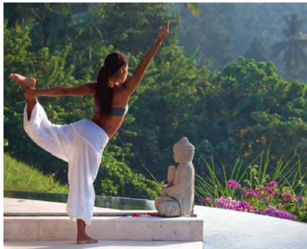
Deluxe Terrace Villa