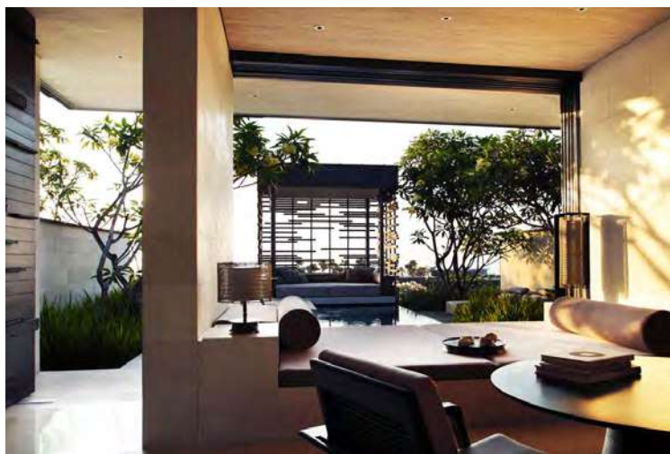
One Bedroom Pool Villa