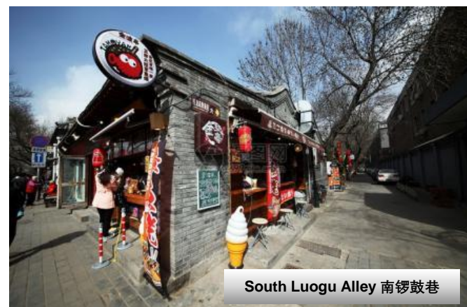
South Luogu Alley 南锣鼓巷