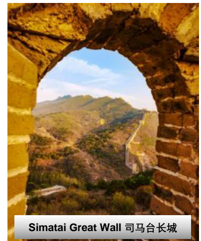
Simatai Great Wall 司马台长城

Taste of old Beijing, Beijing Roasted duck 老北京风味; 北京烤鸭