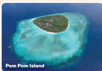
Pom Pom Island