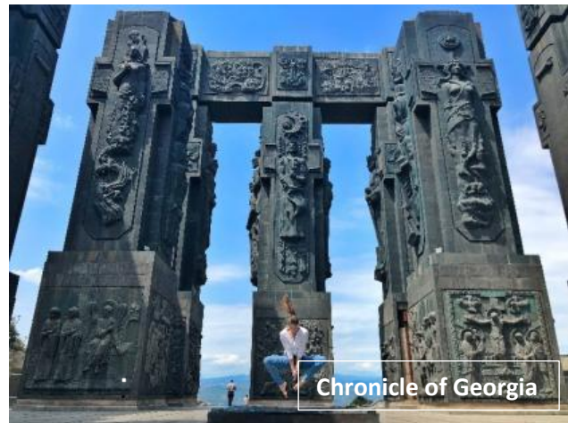
Chronicle of Georgia