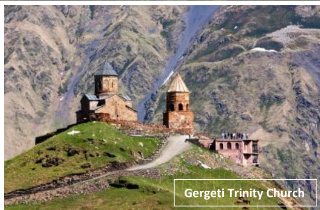
Gergeti Trinity Church

Accommodations: 5* Rooms Kazbegi or similar hotel