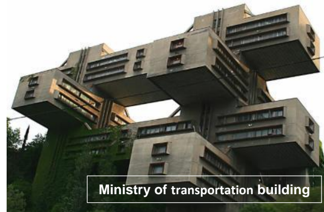
Ministry of transportation building

After breakfast, transfer to the airport and board the international flight back to KUL, ending the beautiful Caucasus tour. 享用早餐后，乘车前往机场乘搭国际航班返回吉隆坡，结束美丽的高加索之旅。