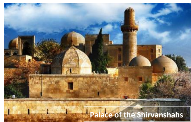
Palace of the Shirvanshahs

Accommodations: 4* Iveria Inn Dolabauri or similar hotel