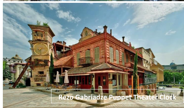
Rezo Gabriadze Puppet Theater Clock