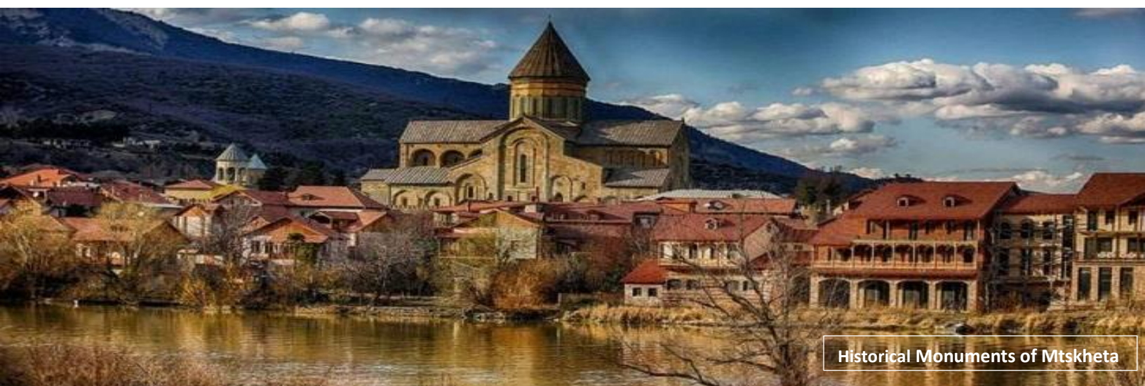
Historical Monuments of Mtskheta