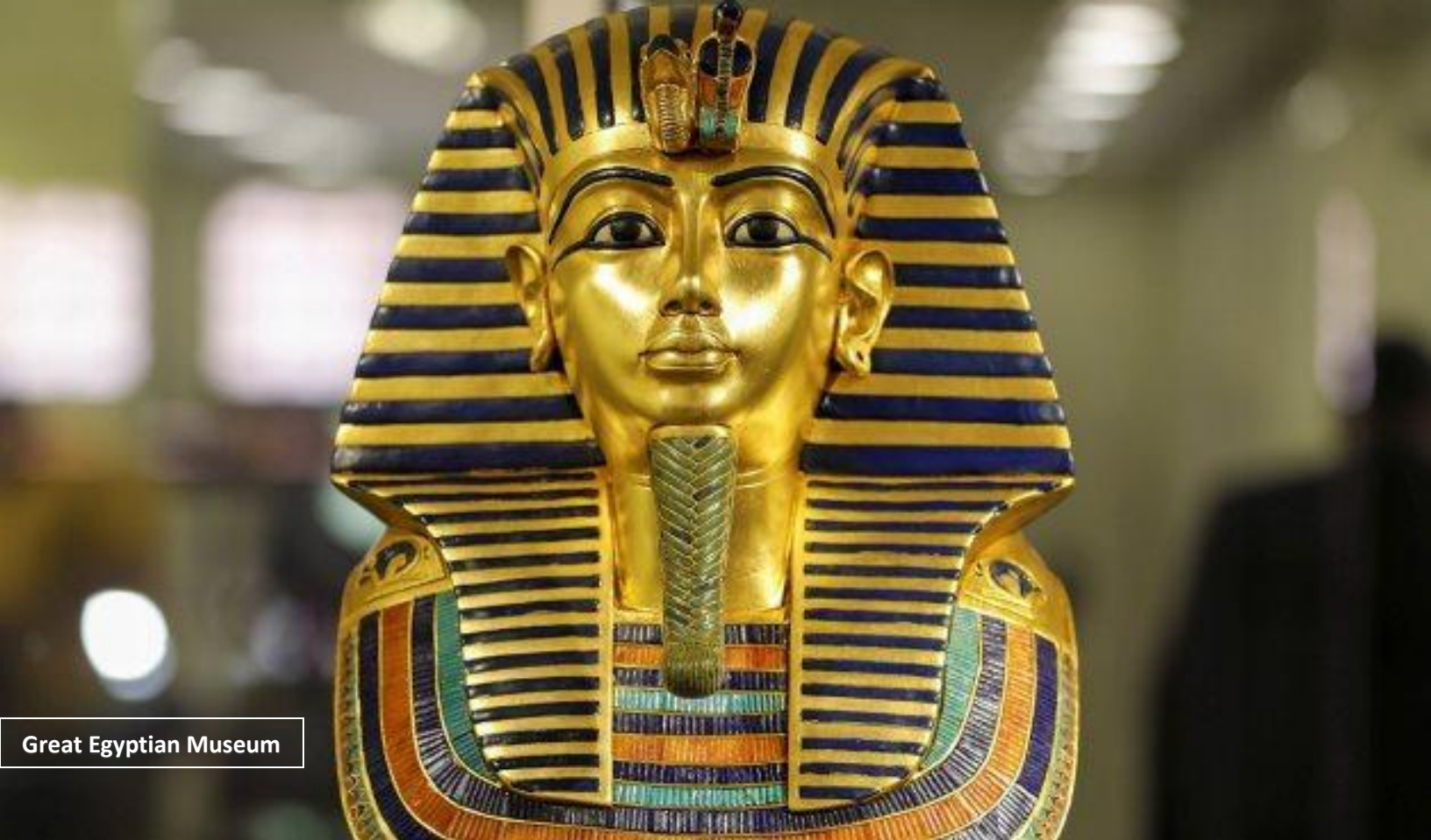
Great Egyptian Museum