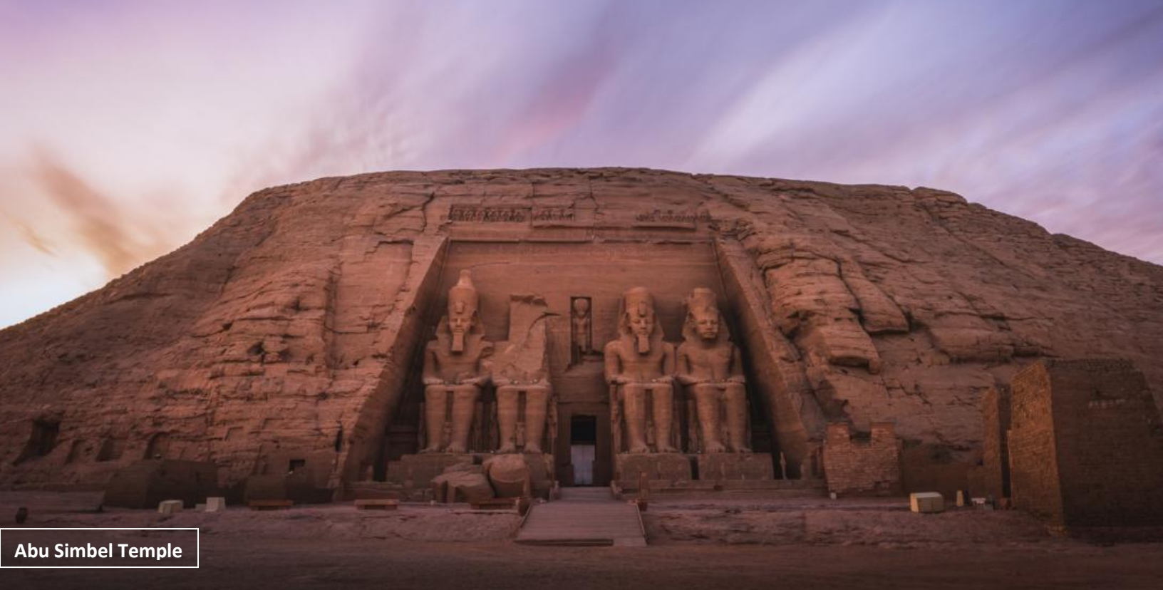
Abu Simbel Temple

After breakfast, excursion to Abu Simbel, originally cut into a solid rock cliff, in southern Egypt and located at the second cataract of the Nile River. Sailing and visit to Temple of Kom Ombo, a double temple, dedicated to Sobek the crocodile god, and Horus the falcon-headed god. The layout combines two temples in one with each side having its own gateways and chapels. Sailing to Edfu and overnight.