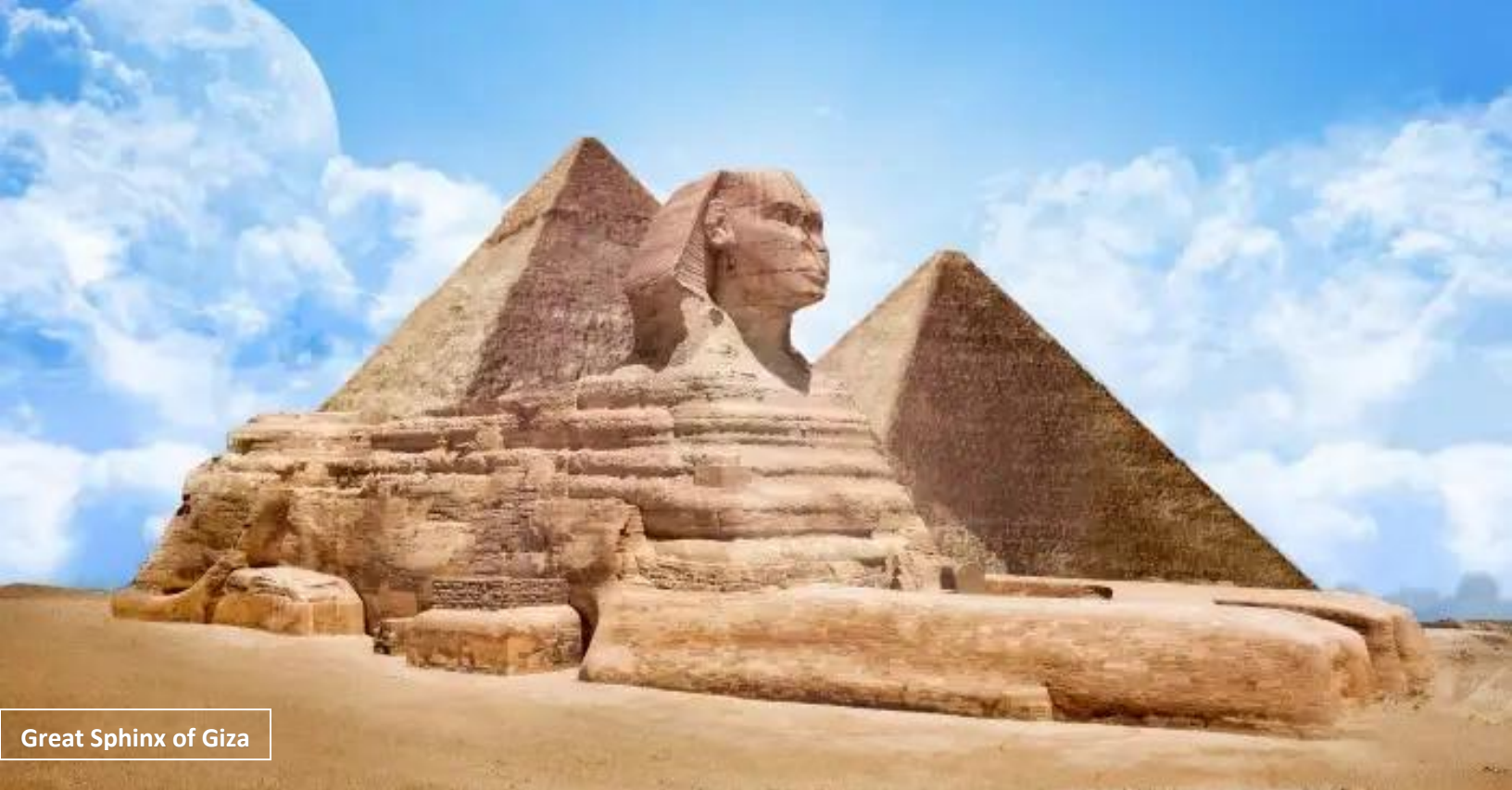
Great Sphinx of Giza