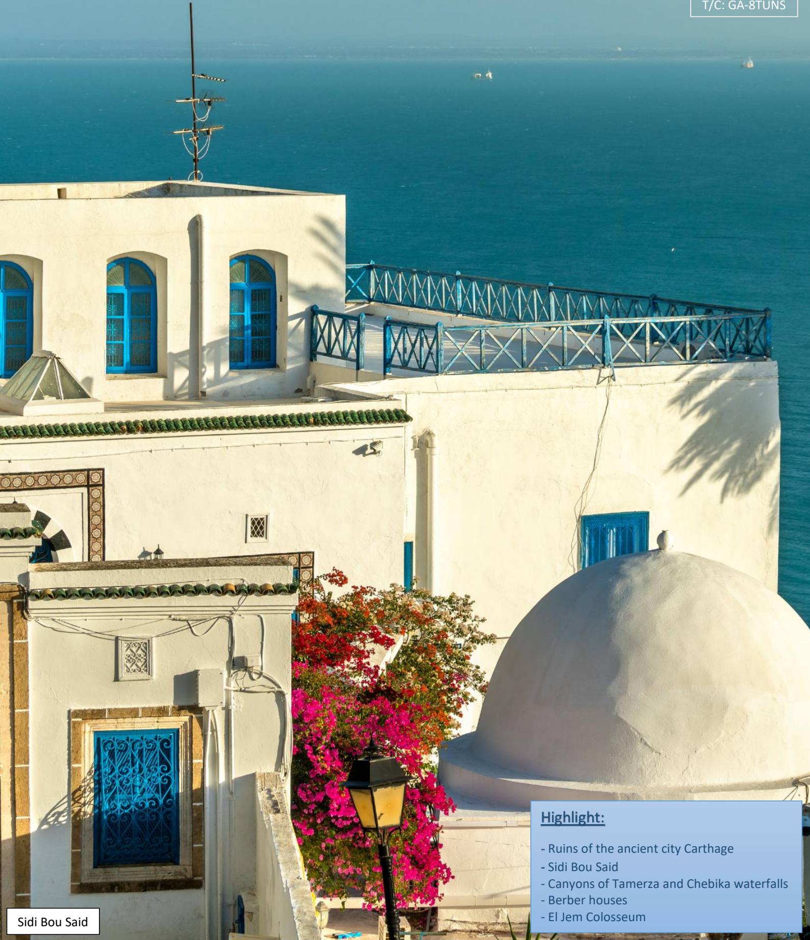
Sidi Bou Said