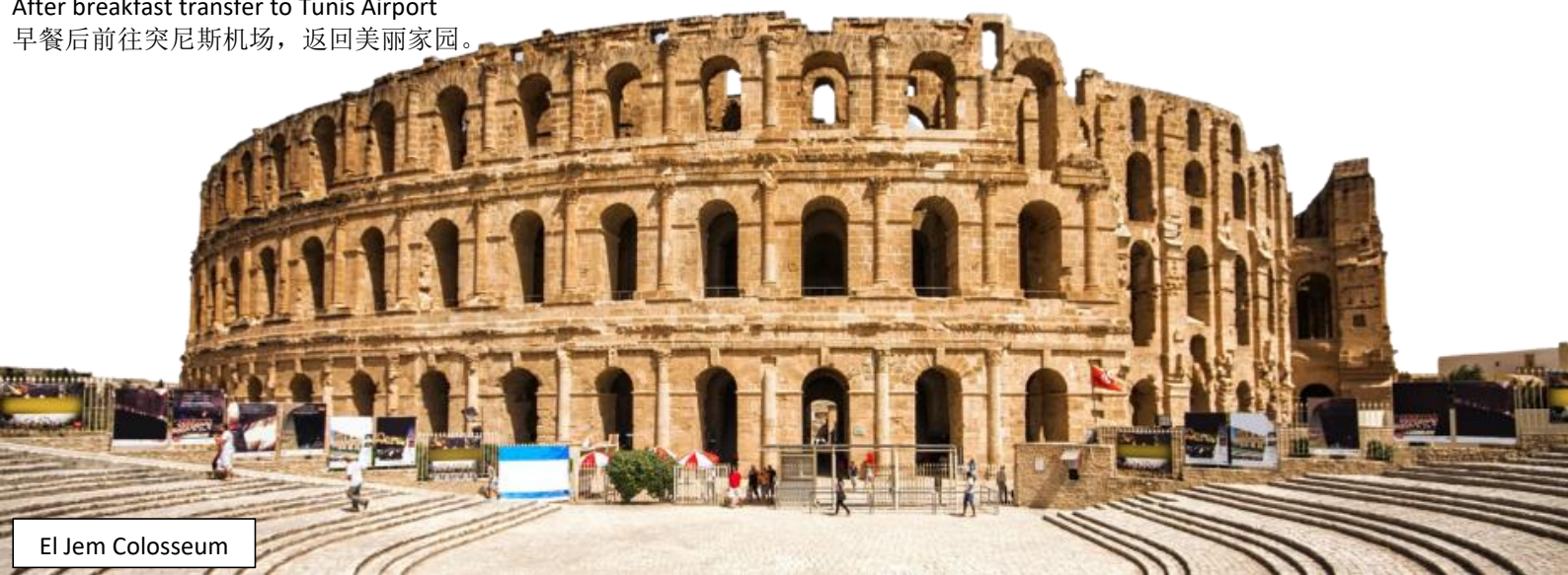
El Jem Colosseum