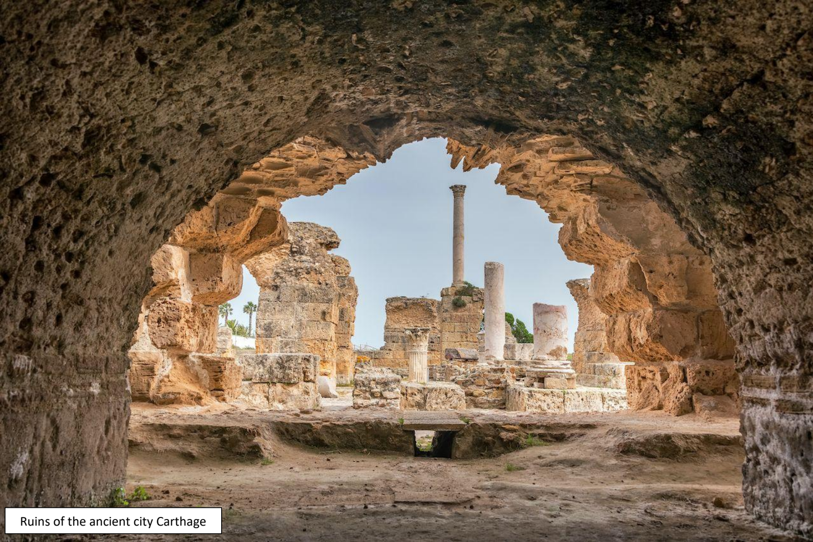
Ruins of the ancient city Carthage