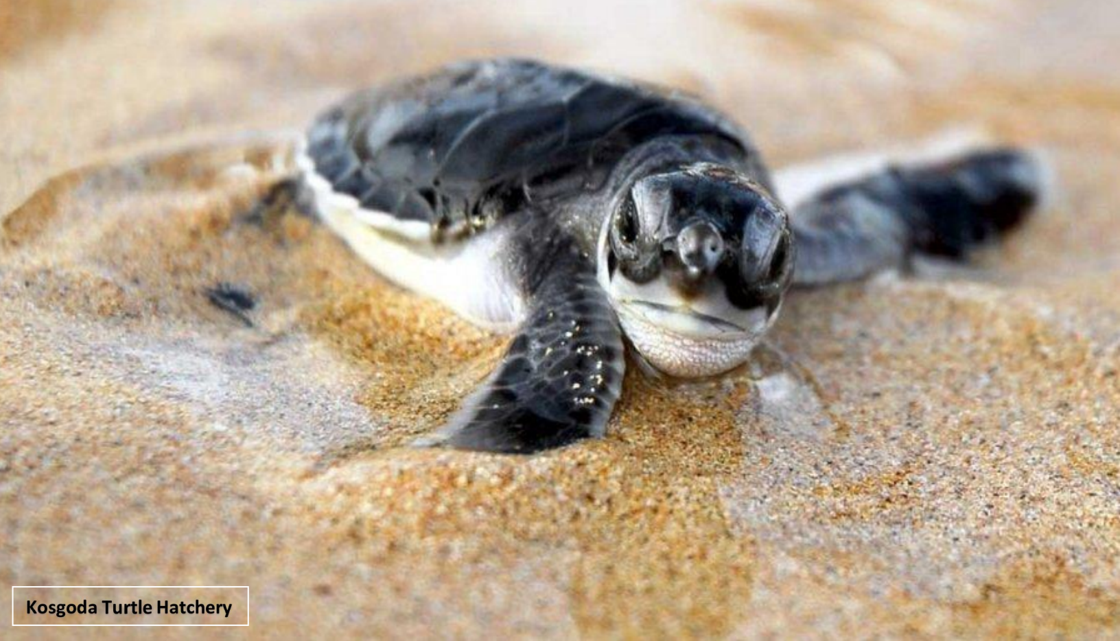
Kosgoda Turtle Hatchery