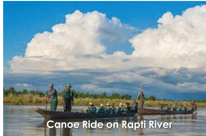
Canoe Ride on Rapti River