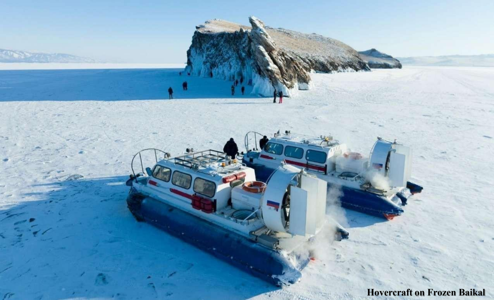
Hovercraft on Frozen Baikal