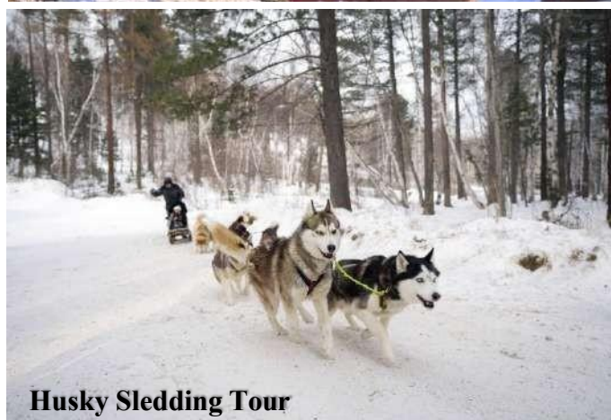
Husky Sledding Tour