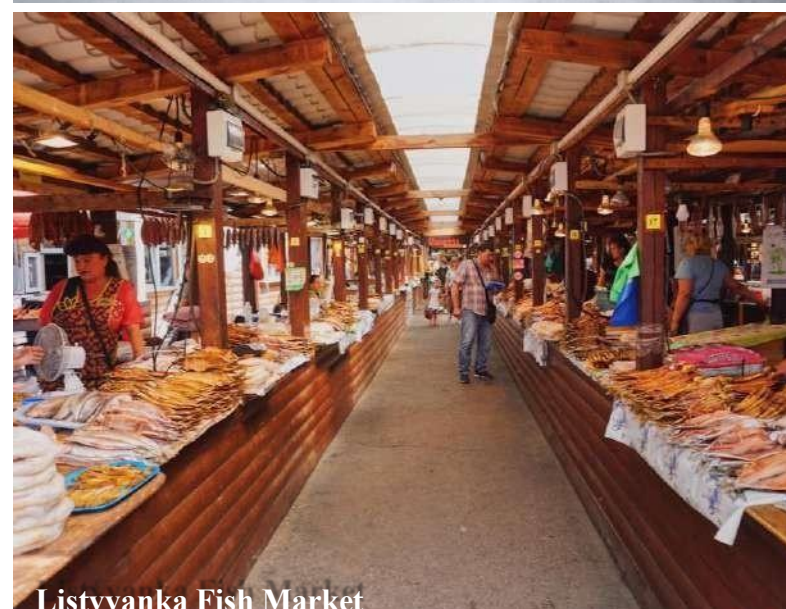
Listvyanka Fish Market