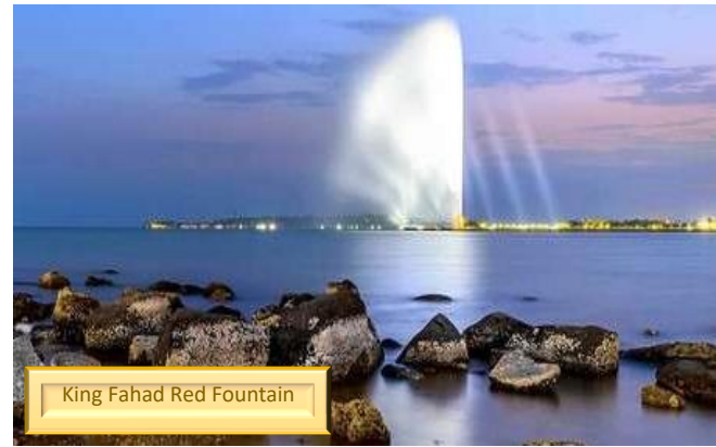
King Fahad Red Fountain

Accommodation: Shaden Hotel 4* or similar 沙登度假酒或相似酒店