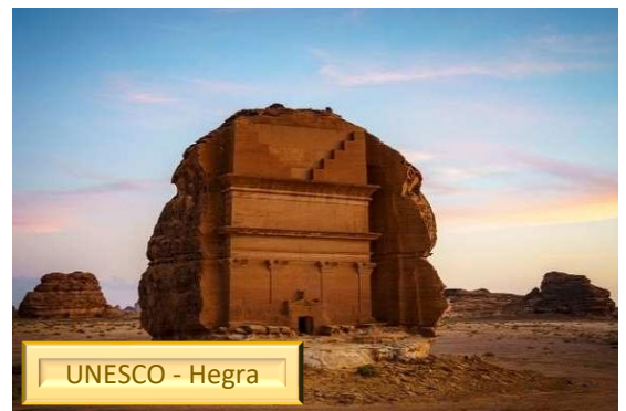
UNESCO - Hegra

Accommodation: Shaden Hotel 4* or similar 沙登度假酒或相似酒店