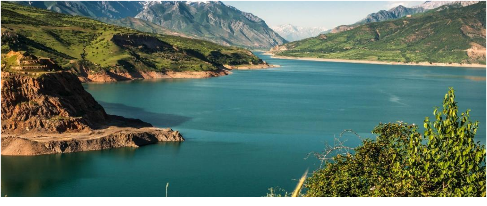
Day 7: Tashkent -Chimgan Mountain (TAS)- Kuala Lumpur 塔什干 - 大奇姆甘山脉-吉隆坡

After breakfast, you will move to Chimgan mountain. As quick as a visit, ride a lift chair (20minute) to reach the top to see the Beldersay peak (30 min one-way). You will have free time to walk and enjoy nature. While returning, you will stop at the shore of Charvak Lake for your leisure and water activities (optional). At the end of the day, transfer to airport and home flights.