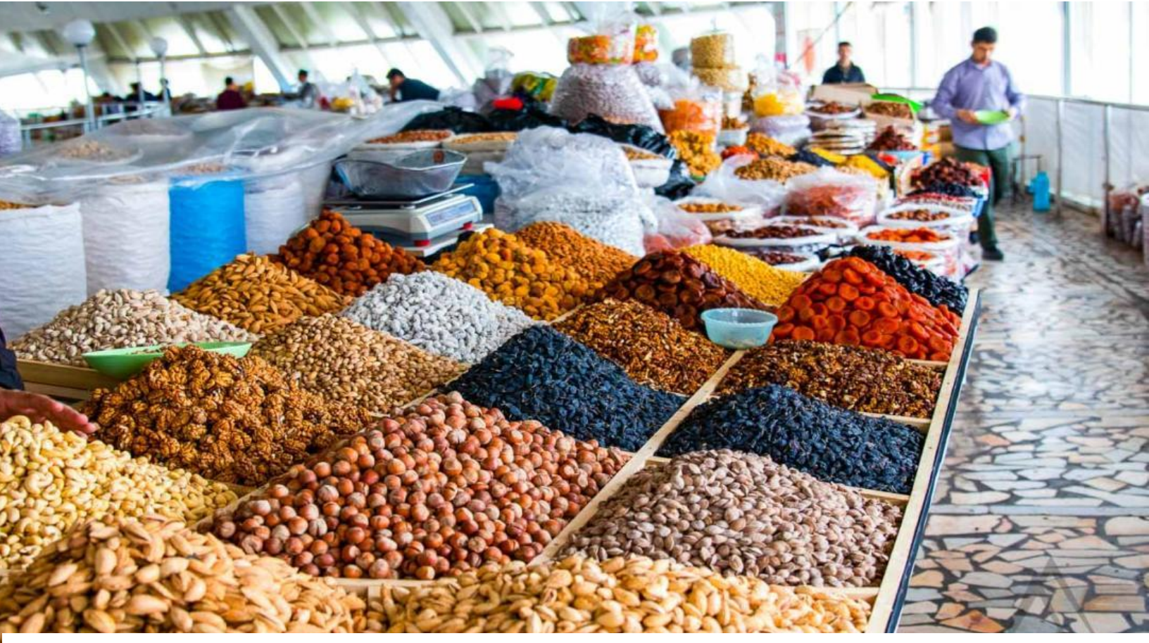
Day 1: Arrive Tashkent (TAS) 抵达塔什干

On arrival at Tashkent, you will be welcomed by our representative who will transfer you to your hotel. 抵达塔什干国际机场后,将会有导游迎接您,并将送您到您的酒店下榻。