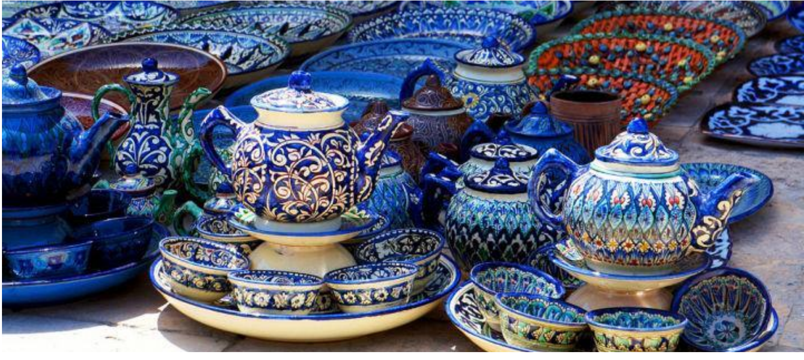
Day 3: Samarkand- City in Uzbekistan 撒马尔罕-乌兹别克斯坦城市

After breakfast, visit famous attraction such as Registan square, Shakhi-Zindah, Guri Emir's tomb and the national market. The Registan Square, a complex of 3 dazzling madrassas dating to the 15th and 17th centuries, is the highlight of Samarkand and one that no one can stop marveling at its scenicism and majesty. The Shakhi Zinda architectural complex depicting a large collection of tombs built in the 15th and 17th centuries, is part of a UNESCO World Heritage Site. Visit the national market, Siyab, which is the oriental market, where it is okay to find traditional Uzbek handicrafts and local pastries. Overnight at the hotel.