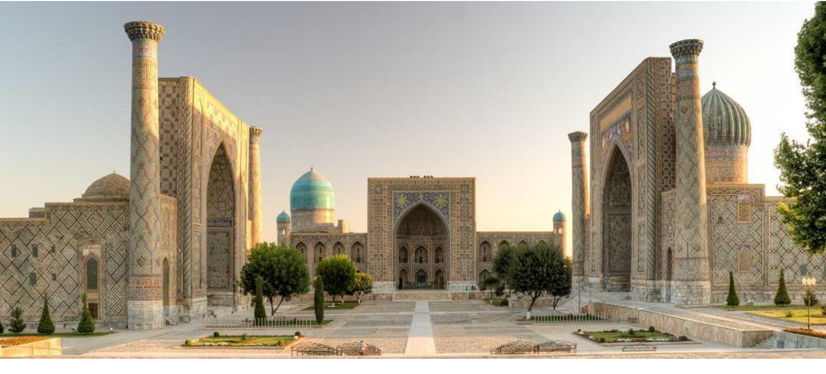
Day 5: Bukhara -City in Uzbekistan 布哈拉-乌兹别克斯坦城市

After Breakfast, you will visit the most ancient fortress in Bukhara, which served as a palace for some businessmen of the Kingdom of Bukhara. After that, proceed the Samanid tomb, which is a masterpiece of building science in the 9th and 10th centuries. Then, the journey continues to Chashma Ayub, which means the well of the Prophet Ayub and the Bolo-Hauz Mosque, which is famous as a 40-column mosque, built in honor of the governor Bukhara Abu-Fayud Khan. After that, you have the opportunity to walk in the shopping dome and visit one of the madrasahs in Bukhara, called Nodir Divan Begi. The trip will end with a visit to the Poi Kalon complex, a unique example of Bukhara's architectural art. It consists of 3 structures built in the 12th and 16th centuries: the Kalon minaret, the Kalon mosque and the Mir Arab madrasah.