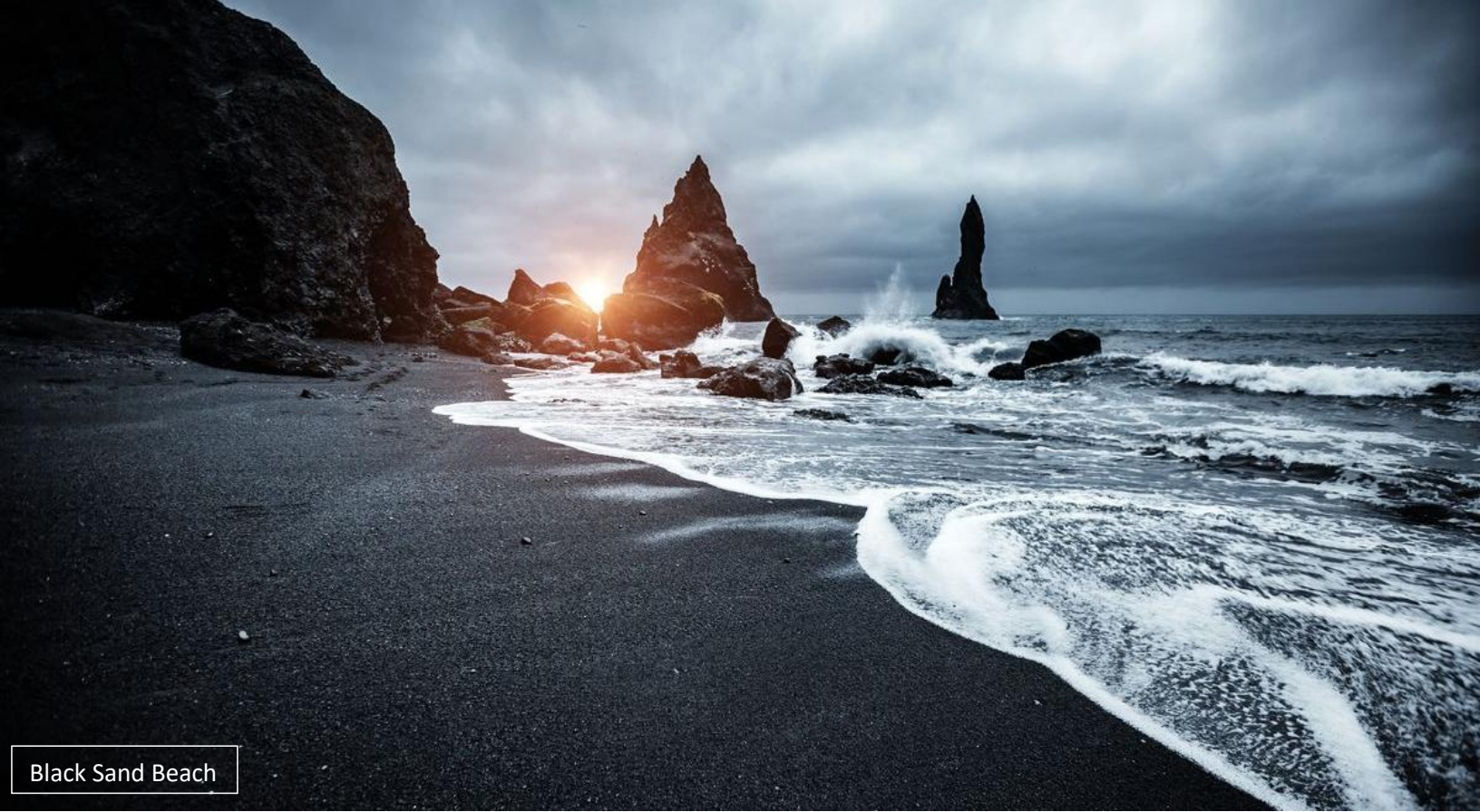
Black Sand Beach