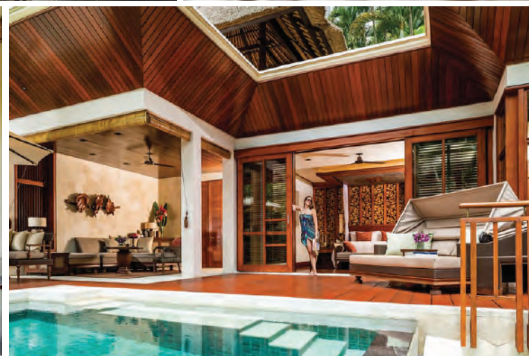
One Bedroom Riverfront Villa