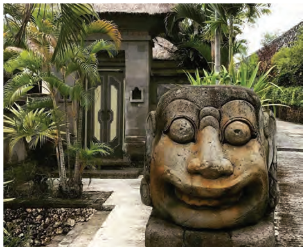
One Bedroom Villa with Oceanview