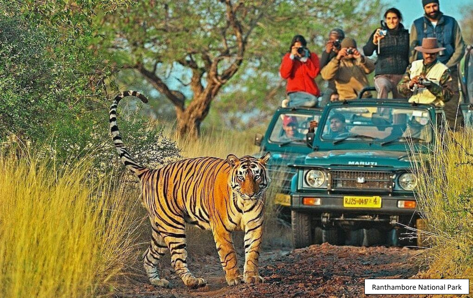
Ranthambore National Park