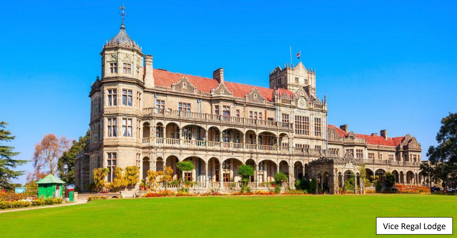
Vice Regal Lodge