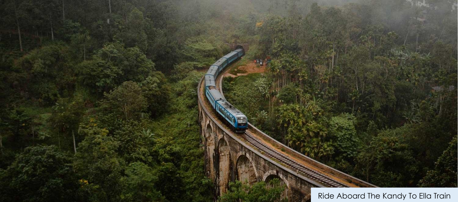
Ride Aboard The Kandy To Ella Train