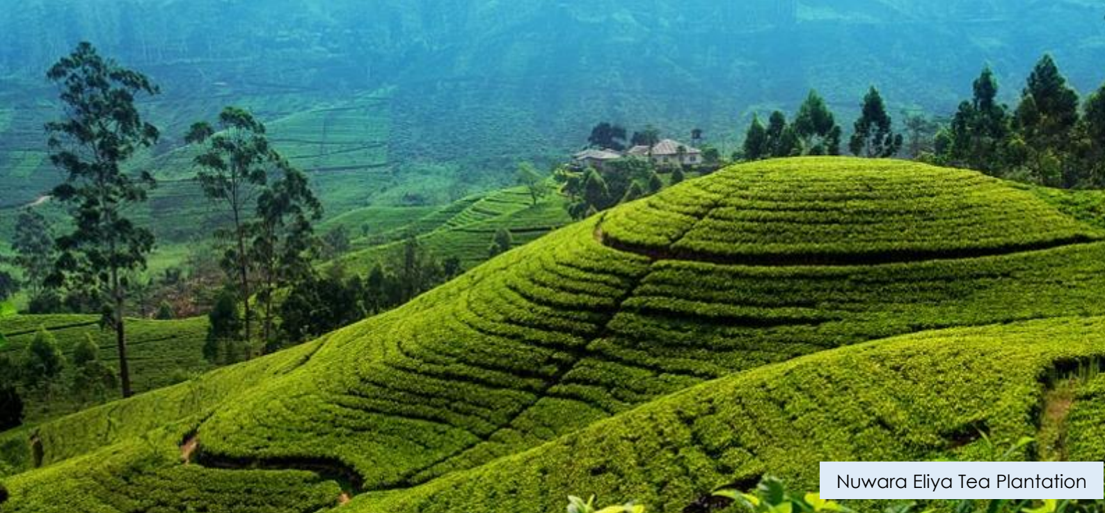
Nuwara Eliya Tea Plantation