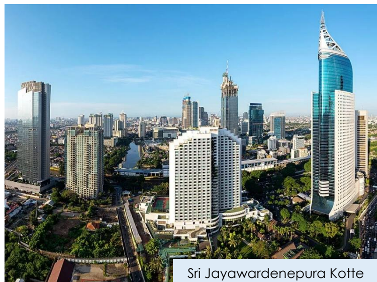
Sri Jayawardenepura Kotte