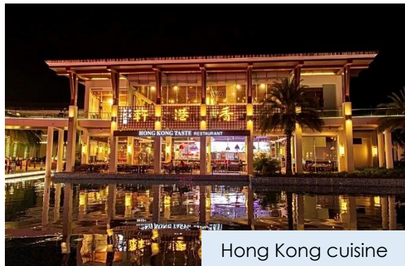
Hong Kong cuisine