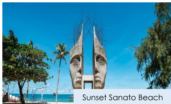
Sunset Sanato Beach